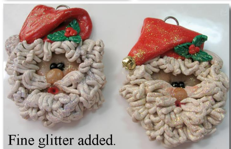
Fine glitter added.